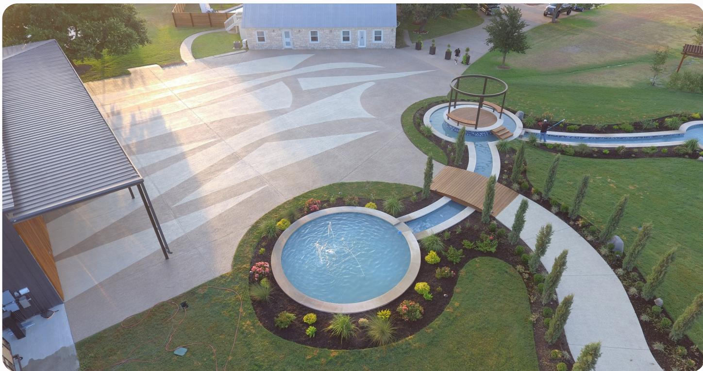
Photograph and installation by Sundek of Austin