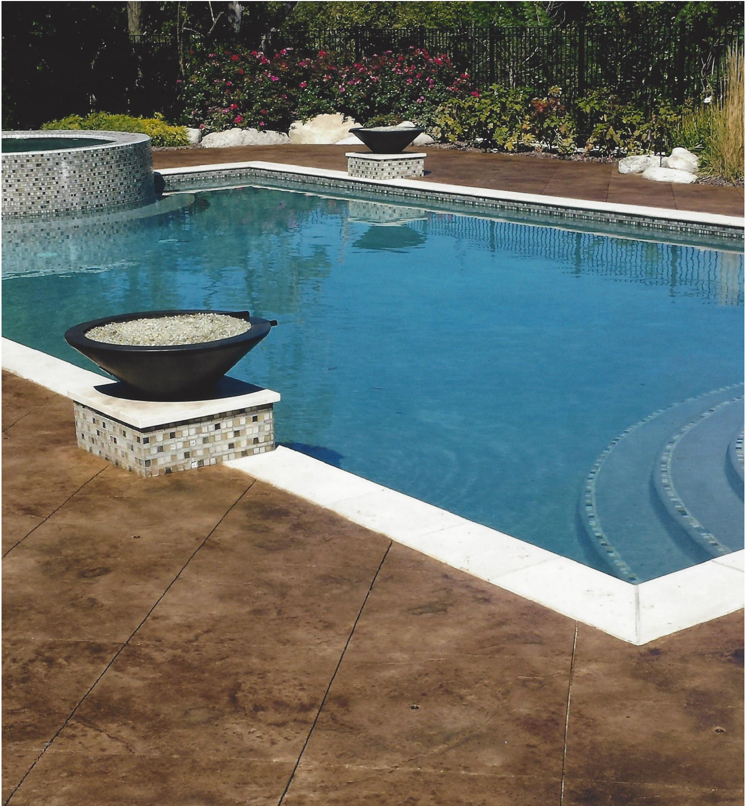
Photograph and installation by Big Red Decorative Concrete